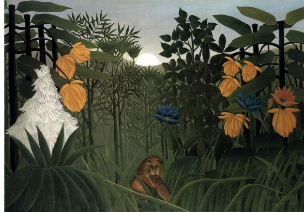
The Repast of the Lion