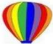
Hot air balloons