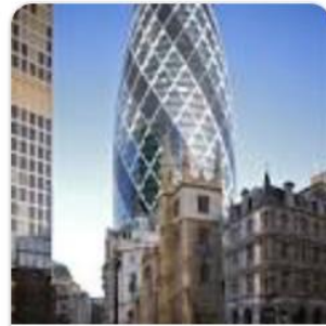
30 St Mary Axe (The Gherkin)